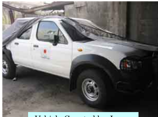
Vehicle Granted by Japan

At the same time, the vehicle has logo stickers of Japanese Official Development Assistance (ODA) saying "From the People of Japan". We hope that it will contribute to visibility of Japanese ODA for the better understanding of Japanese activities in Syria.