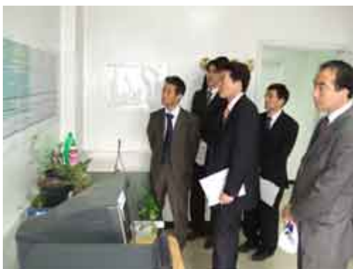
MOF Investigators visit to Main Center

After discussion at the WRIC Main Center, they moved to our surface water observatory at the Barada River to see the actual utilization of the observation equipment granted by Japanese government and the demonstration of current measurement. We hope that the investigators understood the actual situation of Japanese ODA activities and it will contribute the appropriate implementation of ODA.