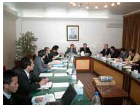
JCC on April 12 th , 2006