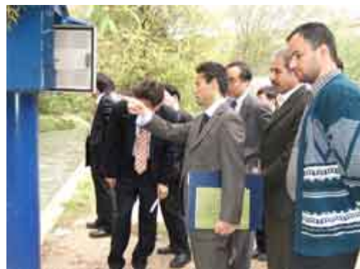
Site visit (Surface Water Station at Barada River)