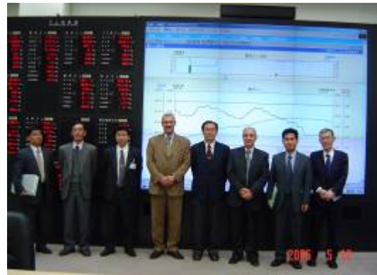
Control room of Tone River dams